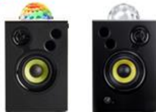
Hercules DJSpeaker 32 Party