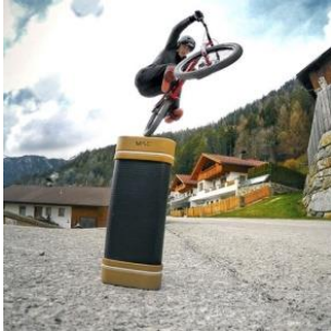
Fabio Wibmer Austria Trials & mountain biking Over 1m YouTube subscribers