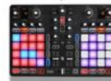
Hercules P32 DJ