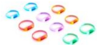
LED Wristbands Pack