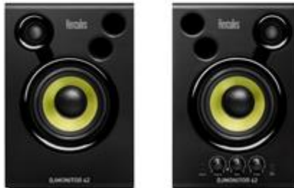
Hercules DJMonitor 42