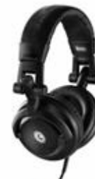
Hercules HDP M40.2