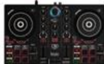
DJControl Inpulse 200