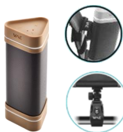
WAE Outdoor 04Plus Pack