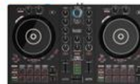
DJControl Inpulse 300