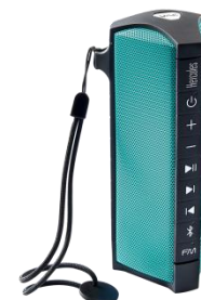
WAE Outdoor Rush