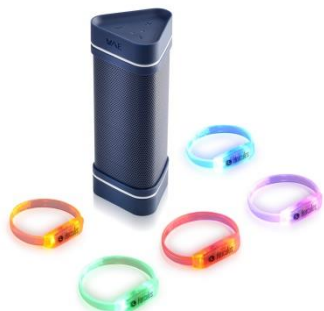
WAE Outdoor 04Plus Party Pack