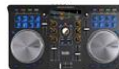
Hercules Universal DJ