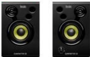
Hercules DJMonitor 32